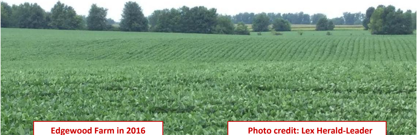
Edgewood Farm in 2016