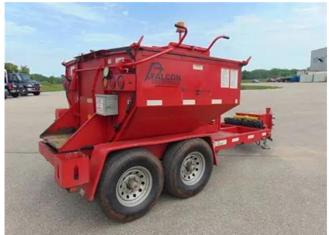
The Pothole Destroyer

We know them when we see them, but how do potholes happen? In a nutshell, potholes occur when pavement has been weakened by water in the supporting soil structure. Vehicle traffic applies the loads that stress the pavement past the breaking point. Potholes form over time, so you may first notice their precursor: crocodile (or alligator) cracking. Eventually, chunks of pavement between the cracks gradually work loose and may then be plucked or forced out of the surface by continued wheel loads, which creates the pothole.