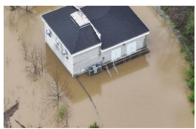
Accessing the raw water intake station by boat