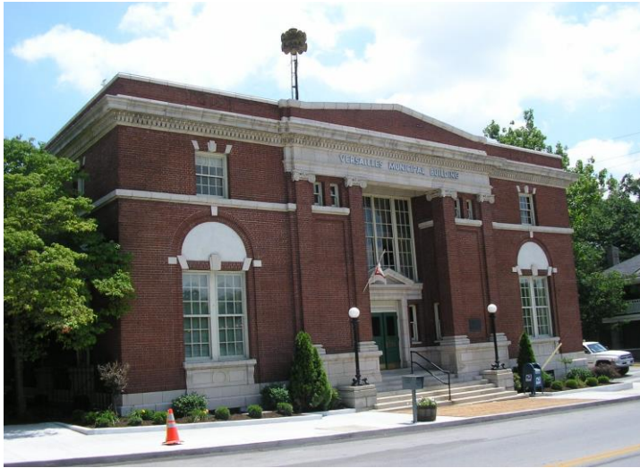
Versailles Municipal Building (City Hall)