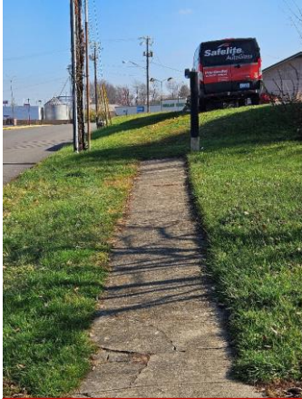
Wilson Avenue's unconnected sidewalk

In the past month-and-a-half, the City of Versailles has submitted three grant applications for federal funding, each through the U.S. Department of Transportation. One is a Safe Streets and Roads for All (SS4A) grant; two are Transportation Alternatives Program (TAP) grants. Read on to learn more.