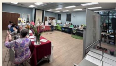
Volunteer Fair / June 22nd

What might this mean for you? If you're part of a nonprofit (charitable) organization, you are welcome to attend the Roundtable's meetings. If not, maybe you wonder where you can find out more about volunteer opportunities, how to make a donation, or where you can get assistance.