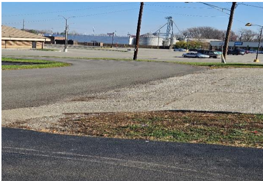
These are also Wilson Avenue.

What does a 20% local match mean? Depending on the grant, that could be a lot of money! The match can be in cash from a variety of sources – local and state money and private funds – or “in kind” in the form of (city) labor, supplies, equipment, real property, services, materials, or space – however, the value of these items must not exceed fair market value.