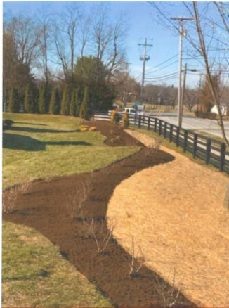
Landscaping in Sugartree

If you get around Versailles with some regularity, you have likely noticed several neighborhood entrances looking a little spiffier than you remember. Thanks to the City of Versailles' Neighborhood Grant program, you're not imagining it! Read on to learn more about the program and how your neighborhood (or area) can access funds to make improvements or enhancements.