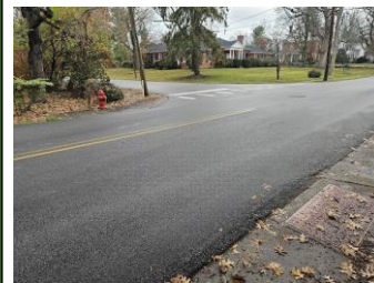
Checking out the intersection at Camden and Elm Street near Kentucky Avenue