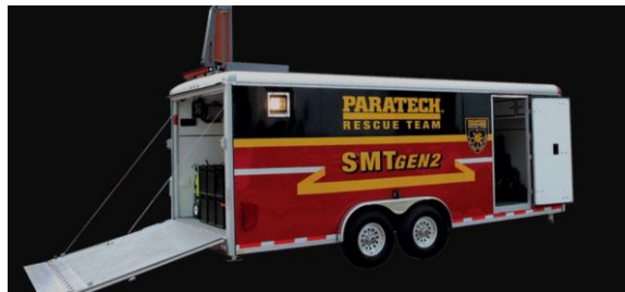
Special Missions Trailer

The Versailles Fire Department (VFD) was recently awarded a $286,000 Kentucky Office of Homeland Security grant to aid in the purchase of a “special missions” trailer. (The total projected budget for the trailer is $358,000.) This trailer will be equipped with tools and materials to aid in search-and-rescue missions in our community and throughout the state in the event of a natural or manmade disaster. Its components are specifically designed to aid in events of structural collapse, heavy equipment rescue, trench rescue, and confined space rescue environments. Another provision of the grant is extensive training for VFD personnel!