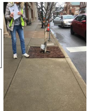
Identifying possible trip hazards on N Main Street