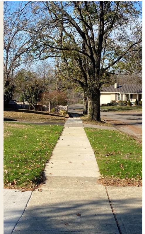
The photo above shows a sidewalk replacement recently completed on Southland Drive. "I am proud of the sidewalks now; they were in such bad shape before," noted one Southland Drive resident.