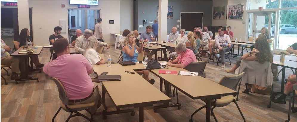
<<< The Downtown Stakeholder Summit held in August, 2022 at KCTCS.

The BSDD Committee meets every other month on the first Thursday from 5-6 pm, usually at City Hall or in the Versailles Police Department’s Community Room. Please join us – we’d appreciate your input!