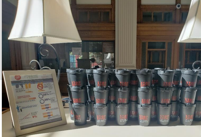
<<< Cupholder Ashtrays in City Hall lobby.

Did you know that cigarette butts are the most frequently littered item in America? Thanks to Bluegrass Greensource and Keep the Bluegrass Beautiful, the city is offering free portable plastic car ashtrays at Versailles City Hall. (They're right inside the front doors.) We've already gone through two batches of about 60 each – there are 55 in this new batch, so come get yours quick if you need one! They fit in car cupholders and have a small metal tray in the bottom to catch ash. Next to the ashtrays, there is a framed infographic that offers interesting statistics on the challenge of cigarette litter.